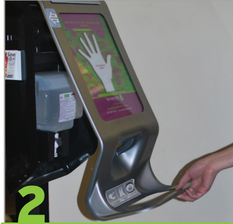
2 If the advertising campaign calls for coupon boxes please remove old ones if necessary and insert new box now into cubby.