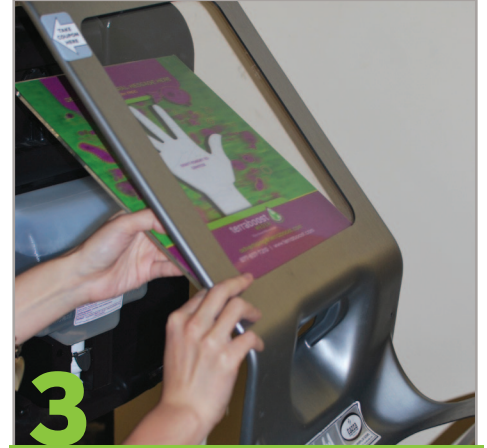
3 Remove the acrylic backing that is holding the current poster in place and discard old ad poster. (Best Technique: Gently rest the cover on the top of your head to keep it open while you work)