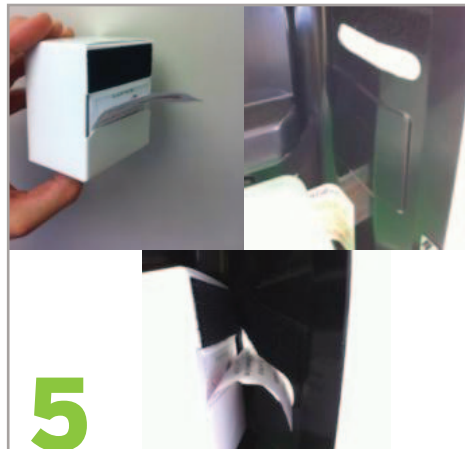
5 Coupon Box Insertion: 1st box should always go on right hand side, if shipped a 2nd box per dispenser the additional box will go on the left hand side. Find the black strip of Velcro on the provided coupon box and match it with the strip of Velcro on the inside shell of the machine, above the slot and press firmly. Feed the first coupon through the slot so that it is accessible from the outside of the machine. Pull first coupon out to ensure next one will feed through correctly.

completed swap and email photos to: photos@terraboost.com (Best Technique: Using a smart phone and emailing right then and there.)*