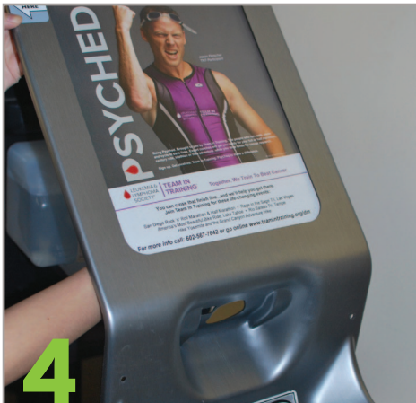
4 Place new ad poster onto acrylic rectangle and reinsert it into the display area making sure it lines up with brackets and magnets on unit and that the poster is straight. (Best Technique: Apply two pieces of scotch tape to the top and bottom of the ad and adhere onto acrylic piece to ensure it is straight) ***Please take a photo of the